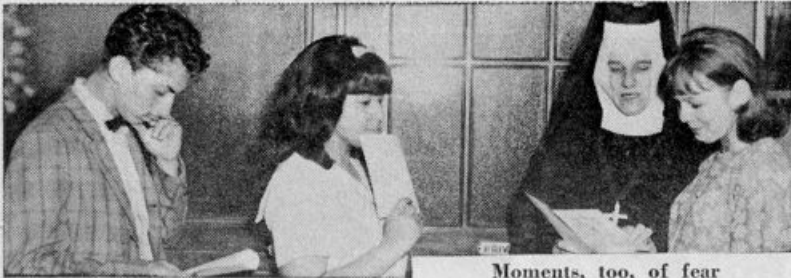
Moments, too, of fear