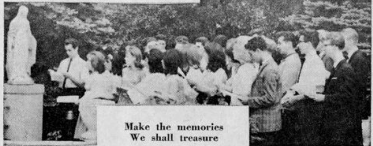
Make the memories We shall treasure