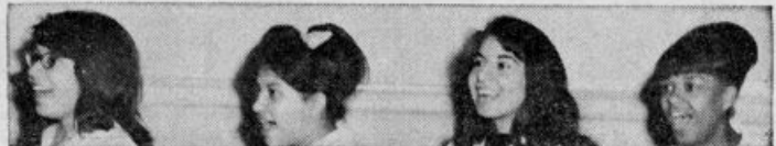
Rah! Rah! Rah!